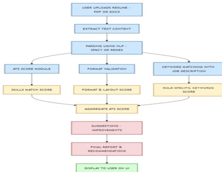
Fig 1. Resume Analyzer Flow Diagram